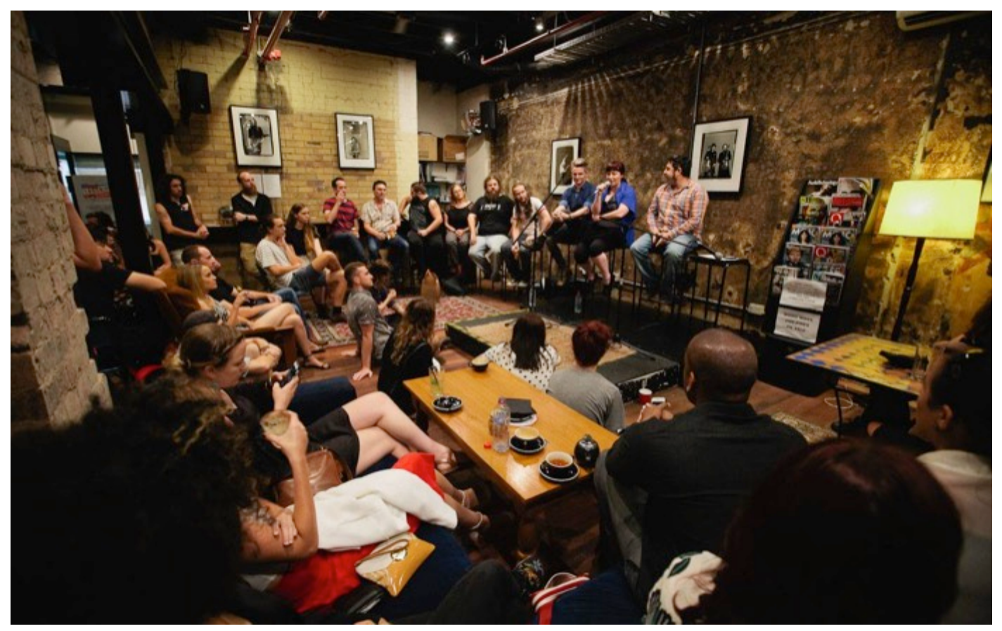
Hook Up Workshop and Networking Session at Foundry Records 2015.