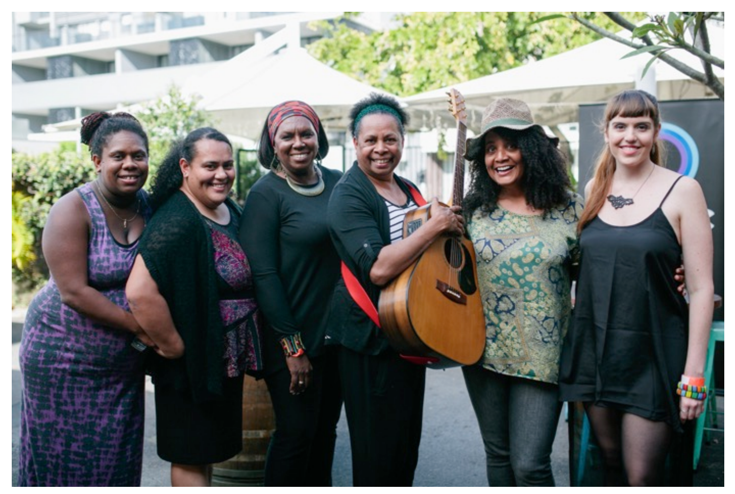
BIGSOUND 2015 Women In Music Networking Event

Our annual Women In Music networking event was again held in the lead up to BIGSOUND to provide a specific opportunity for women in the industry to network and do business before the chaos of BIGSOUND begins. Over 100 women attended the event.