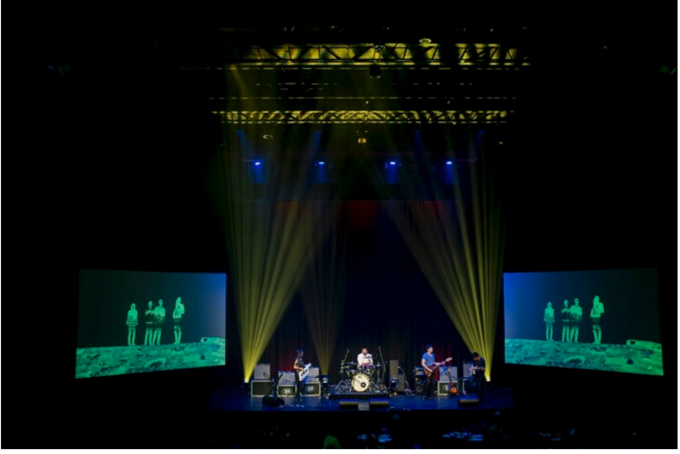
Blank Realm performing Queensland Music Awards 2015, Brisbane Powerhouse